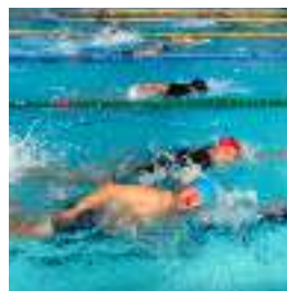
National Standard Swimming Pool

Zhongqiao Café- A cozy space for relaxation and socialization, offering a beverage service area with coffee and tea for students and faculty.